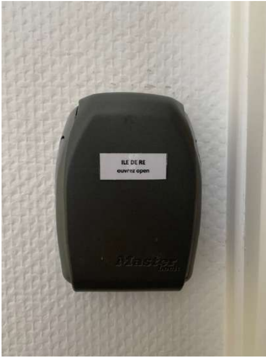
Boîte à clés fermée Safety keybox closed