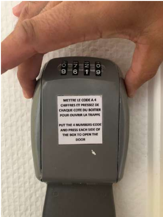
Mettez le code à 4 chiffres Put the code to 4 numbers