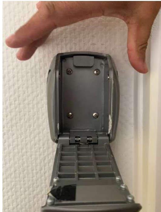
Pressez les boutons sur les côtés pour ouvrir la trappe. Récupérez les clés. Press the buttons on the sides to open the hatch. Pick up the keys.