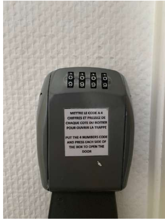
Descendez la trappe pour l'ouvrir Lower the hatch to open it